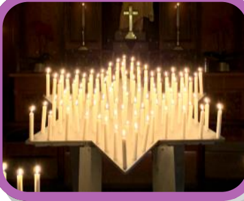
Fully Lit Star of David