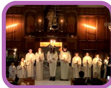
Santa Lucia Participants