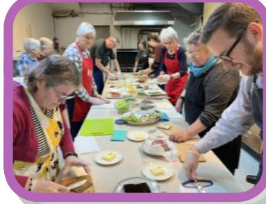
Danish Sandwich Making Class