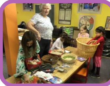
Packing Shoebox Gifts