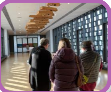
Viking Girls at Music Centre