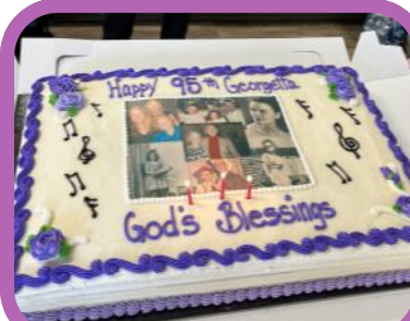
Oh look! A cake!