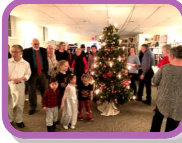
Singing 'Round the Christmas Tree