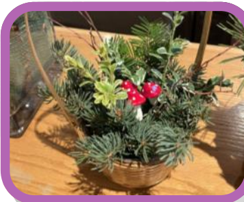
Viking Girls Centerpiece