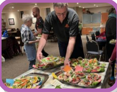
Sandwiches Ready to Eat